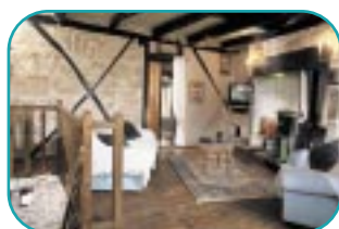
Cottage No. 4 – lounge