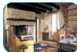
Cottage No. 6 – lounge